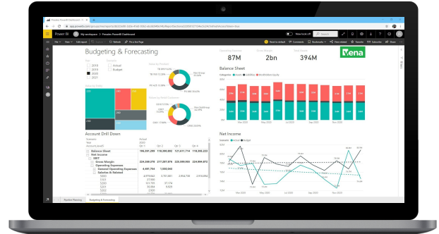
Self-serve, dashboard reporting with real-time performance data